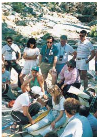
The workshops feature practical skills taught in small groups.