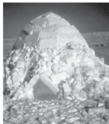
Learn to build igloos and other snow shelters