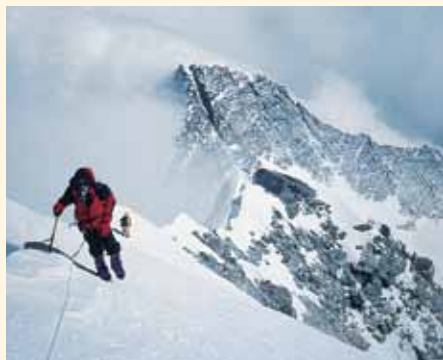
Climbers approach the summit of Everest as the deadly storm rolls in.