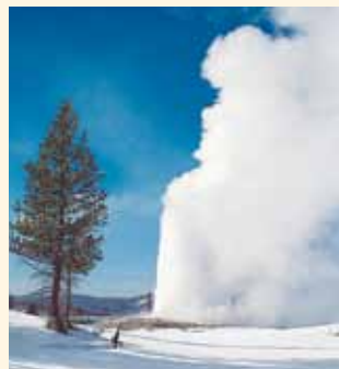
Old Faithful's beauty is enhanced by clear winter skies

J oin us... for a visit to this wonderful national treasure in "the best" season. Our nation's largest park is a sight to behold in the winter. View the majesty of Yellowstone park on either a snowcoach or a guided snowmobile. Tours can be booked with A Meeting by Design at 888-995-3088.