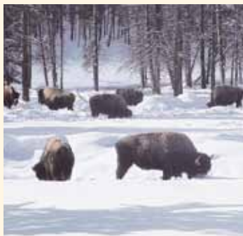
Bison foraging for winter food at Yellowstone

J oin us... for a visit to this wonderful national treasure in "the best" season. Our nation's largest park is a sight to behold in the winter. View the majesty of Yellowstone park on either a snowcoach or a guided snowmobile. Tours can be booked with A Meeting by Design at 888-995-3088.