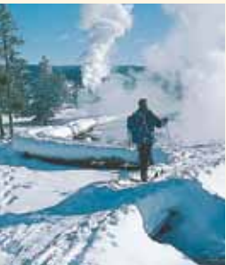
Cross-country skiing is fantastic at Big Sky and nearby Yellowstone

SLEIGH RIDE DINNERS - A horse-drawn sleigh ride through the snow covered mountains is an unforgettable pleasure. Call Lone Mountain Ranch at 406-995-2783.